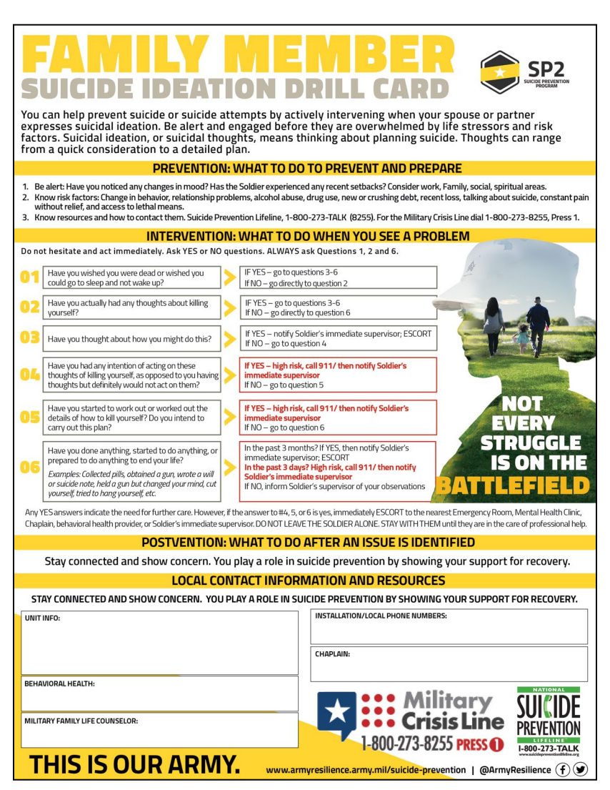
Figure B-3. Family Member Suicide Ideation Drill Card